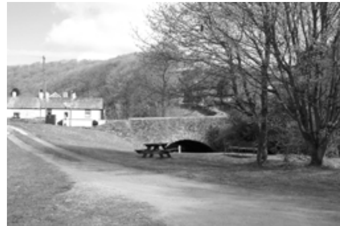
View from Village Hall towards Bridge

Sadly, the Hall is at present badly in need of repair to walls and roof. A survey has been completed with support from Claren and Voluntary Action Cumbria. Applications for funding of the necessary works, together with fundraising in the village offer the prospect of its revival in the near future.