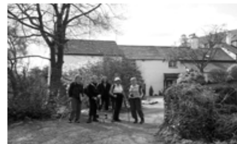
Cumbria Way walkers passing by the Hall

Grants have been applied for with Awards for All England and the Hadfield Trust and more applications are pending. We have spent approximately £3500 in the last two years weatherproofing and painting the Hall, most of which has been funded from money-raising events in the community. We have received £900 from Cumbria CC South Lakeland Division for the cost of painting.