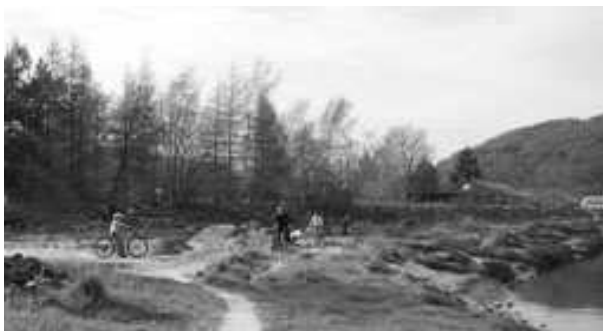
Children playing by river, but area also used as emergency slipway

Greater use could be made of the P/G Village Hall, which, since refurbishment, provides a comfortable and inexpensive venue. Likewise in Sparkbridge and Broughton Beck, which both have high ceilings, and once upgraded, will be able to provide suitable venues for a variety of activities, including sports such as badminton.