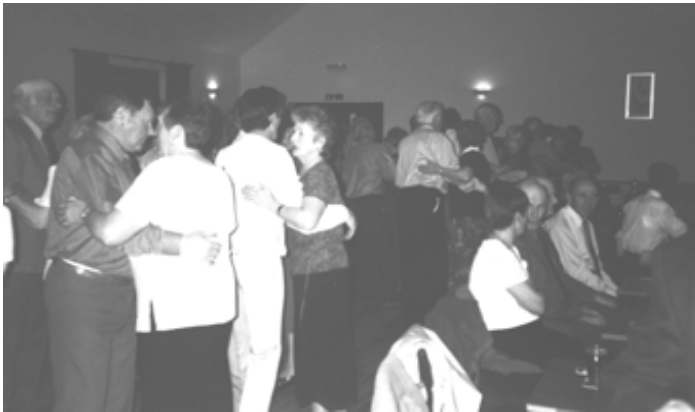
Dance to celebrate re-opening of Hall, 2003

The Hall, which stands at the entrance to Greenodd village, is administered by a Management Committee appointed yearly at the Annual General Meeting. The Hall is registered with the Charity Commission. The objectives of the Management Committee are to maintain the building, provide a warm and comfortable environment in which the various users from the villages and surrounding area can hold their events, and to keep the rental charges for the rooms to a reasonable level.