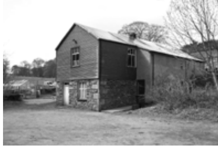
Village Hall, rear view

Spark Bridge Village Hall was built and opened in 1928 out of funds raised by the villagers for educational, recreational and social purposes. At different periods in its history it has been a focal point for social activities in the village and many Spark Hill villagers refer to events at the Hall with fondness. In recent years, use of the Hall has been diminishing partly due to its deteriorating condition and in part due to increased holiday lets and fewer young families in the village.