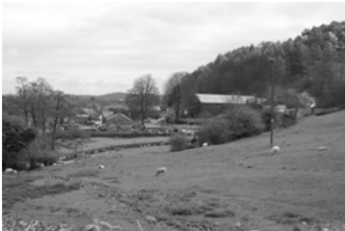
Newland, with old furnace and charcoal store still visible

Industrial development could be said to have started in the parish in the 13c, when the monks from Conishead Priory were given permission from the Lancasters to mine and forge the iron, but it was not until the 18c, when the price of Swedish ore rose dramatically, that iron furnaces were built at Newland, Pennybridge, and in the adjacent parish at Backbarrow. At the same time, copper began to be mined at Coniston and exported from the small 'port' of Greenodd, which provided the highest navigable point on the estuary.