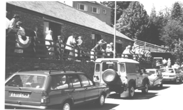
Opening Day ceremony, 2003

The use of the Hall has increased considerably since the re-opening in 2003 with a wide variety of classes and events being held. No extra funding is envisaged in the near future, as the finances are in a healthy state and it is hoped that the Hall will provide a centre for future generations of inhabitants of the two villages into the next century.