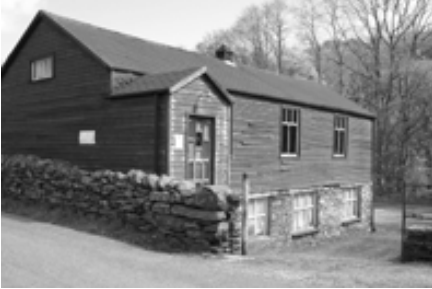
Village Hall, main entrance