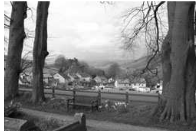
View across Pennybridge from churchyard