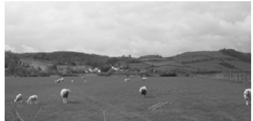
View across fields to Arrad Foot, with some Parish Lands to the right

The aim of the Charity is still to provide financial assistance to the inhabitants of Egton cum Newland, particularly in relation to the education of children. For example, it can help families to fund their children's school outings and projects, and it gives grants to university or college students for books and equipment. Penny Bridge School and Greenodd preschool also benefit from donations, as do other local organisations.