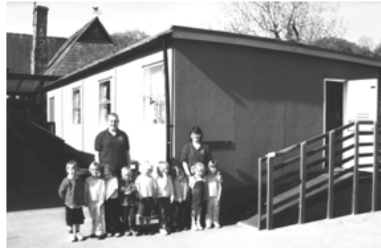
A Monday morning at the pre-school

own children, which means that all the equipment for our outdoor activities need to be easily stored away. Having our own playground and garden area would enable the staff to enhance and develop a wider curriculum for outdoor play. Additional rooms in the pre-school would mean that we could accommodate more children and have separate areas for the different age groups. In the short term, the pre-school would like to improve its ICT; our current equipment was donated and has no internet facility. In this age of increased technology, the pre-school would like to offer its children a greater knowledge of ICT to aid them in their future development.