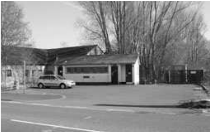
Closed public toilets

This question was used by many people for constructive comment on matters which they felt could be improved upon, but which they didn't want to register as a 'strong dislike' in the previous question.