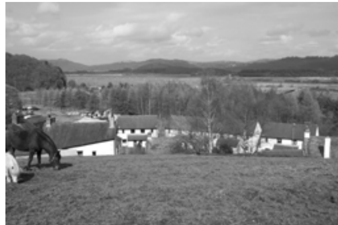
Leven estuary from Greenodd

The combined parishes stretch from the upper reaches of the Leven estuary to the Furness Fells west of Ulverston, in a four mile wide band. By the Leven estuary, the land is mainly comprised of drained salt marsh, with a small intrusion of iron bearing limestone on its southern border. The fell slopes rise to 1000ft and are comprised of rough pasture and grazing, with some heather on the high ground. The land in between is mainly comprised of loamy soil on top of slate.