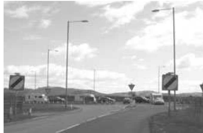
Junction of A590 and A5902

As can be seen from the children's questionnaire, parents are managing to provide a wide range of activities for their children, but it requires transport and time. Safe areas for the children to play at Greenodd and Pennybridge need to be found.