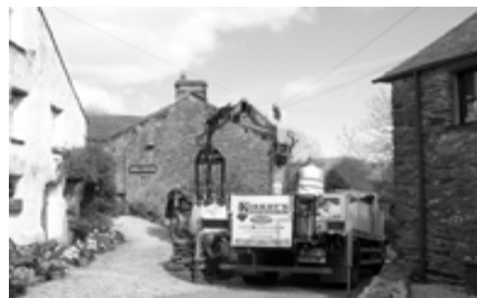
Access road to Hall

end plans have been drawn up to comply with the DDA and at the same time improve insulation and overall efficiency and safety. Estimates for changes and improvements have been received from Cumbria Energy Audit for heating and insulation and we are waiting for the detailed estimates relating to the internal structural alterations required.