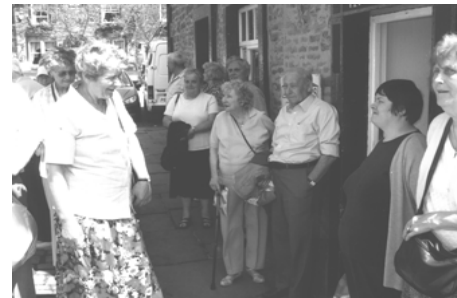
Canal Cruise, Skipton. 2005.

On the fourth Wednesday of each month from February to November we have a coach trip to various places of interest within touring distance. Non members are invited to go on the trips, space permitting. We also visit the theatres at Keswick and Blackpool.