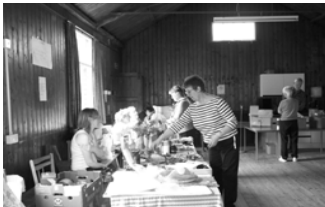
Fund raising coffee morning, May 2006

Spark Bridge Village Hall was built and opened in 1928 out of funds raised by the villagers for educational, recreational and social purposes. At different periods in its history it has been a focal point for social activities in the village and many Spark Hill villagers refer to events at the Hall with fondness. In recent years, use of the Hall has been diminishing partly due to its deteriorating condition and in part due to increased holiday lets and fewer young families in the village.