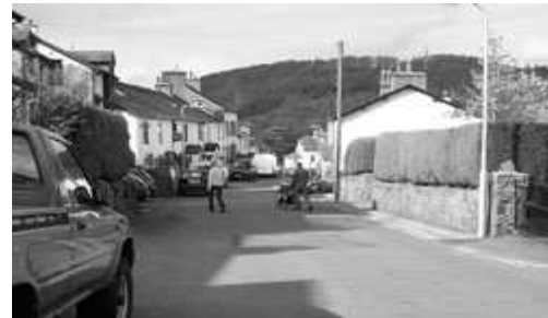
Pennybridge Main Street

The popularity of the Lake District as a place for a second 'holiday' home has exacerbated the situation, although it is worth remembering that many 'second homes' belong to people brought up in the Lake District who seek to retain a family connection in the area and may possibly retire here.