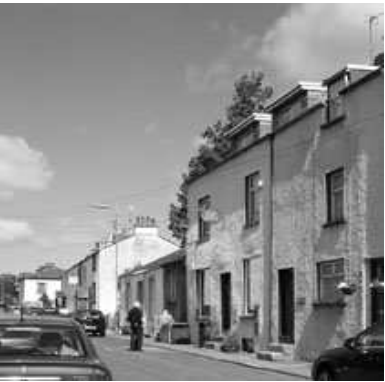
Greenodd Post Office

Greenodd is fortunate in having a Post Office/village store, a Bakery, a Petrol Station, two Pubs and a Butcher's shop. These are well used and much valued by the Greenodd / Pennybridge sections of the parish. Those living in Mansriggs, Osmotherley and Newland find it easier to use Ulverston and Booths. 276 of the respondents use their village halls. Greenodd and Pennybridge Hall was refurbished in 2003 and is much used by a variety of groups. Broughton Beck and Spark Bridge Village Halls are seeking funding to improve their facilities.