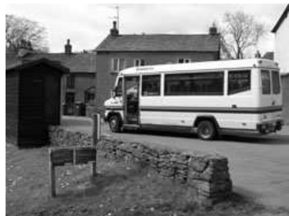
Bus service at Sparkbridge