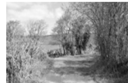
Possible parking space near Hall

Grants have been applied for with Awards for All England and the Hadfield Trust and more applications are pending. We have spent approximately £3500 in the last two years weatherproofing and painting the Hall, most of which has been funded from money-raising events in the community. We have received £900 from Cumbria CC South Lakeland Division for the cost of painting.