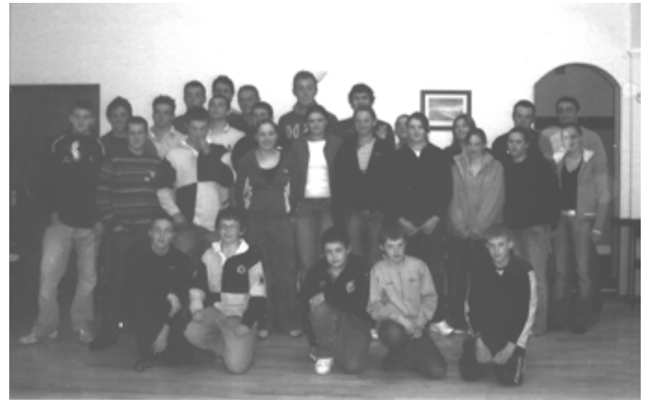
Lowick Young Farmers 2006.

As well as competitions, we are involved in fundraising for both our club and the County Federation as well as local charities. Recent fundraising events have been a 13 mile sponsored walk from Broughton to Lowick, and a Duck Race held at Colton. Our annual Whist Drive also raises funds for the club as do the attractions on our stand at Lowick Show.