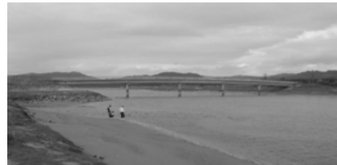
An evening stroll on the Leven estuary

In common with much of South Lakeland, the area also supports a large number of retired people.