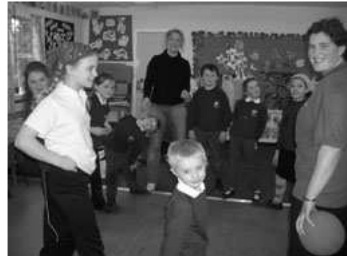
Children with staff 2006

Fees are charged for each session and are supplemented by grant funding from various bodies including Cumbria Community Foundation, Neighbourhood Forum and Surestart.