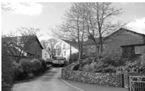
Broughton Beck, with gable wall of Hall visible on right.