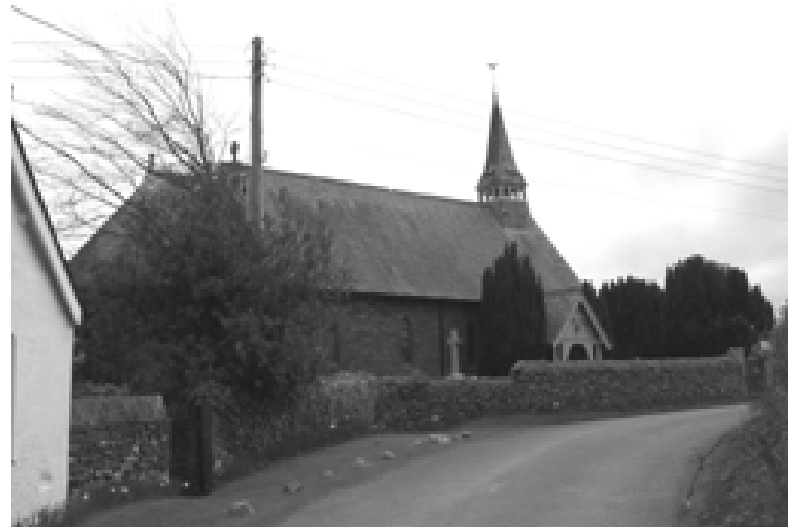
St. Johns Church, Broughton Beck