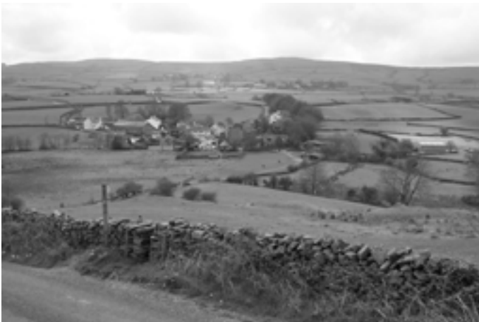
Broughton Beck, Osmotherley Parish

Osmotherley appears to have derived its name from the family called Asmunderlauhe (later known as Asmundrelaw), who rented it from the Lancaster family as long ago as 1240.