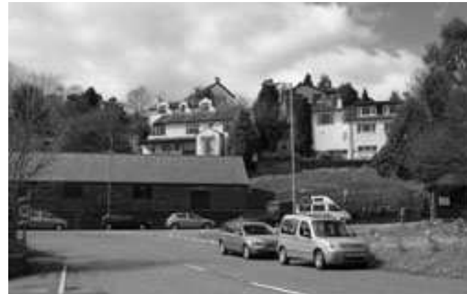
Pennybridge Village Hall

There were some requests for adult education classes to be held in Greenodd / Pennybridge Hall. This perhaps reflects the transport difficulties when attending classes in Ulverston.