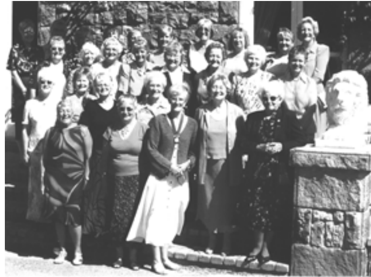
Diamond Jubilee celebrations at Grange Hall, 2005

Over the years, we have worked hard in the community. In the early years, WI fought to get street lighting and improved bus services. It was through a National WI resolution that the 'Keep Britain Tidy' campaign was started. We have planted bulbs outside the local Village Hall and we maintain a heather garden. Today, we are fighting to keep our local toilets open as we feel they are a much needed service for the general public.