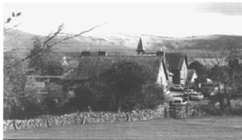
View of the front of the school

The teaching staff consist of three full time staff, including the Head, and two part timers. In addition, it has three teaching assistants. A new Head Teacher has recently been appointed, and will take up the post during the Summer Term, 2006.