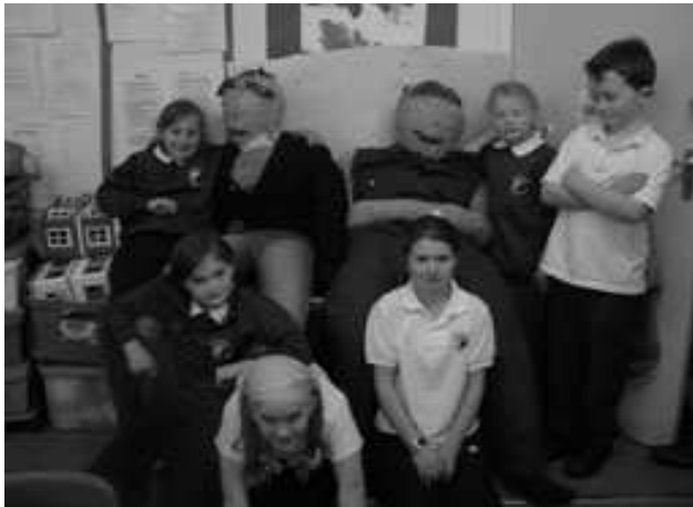
Children with their 'guys'

In 2000 a small group of parents with children at Penny Bridge School felt that there was a need for an After School Club in the area. There were no other childcare facilities and many parents had difficulties in juggling their work with childcare after school and in the school holidays. Grant funding for set-up costs was obtained and a qualified Playleader was eventually found so that the club opened in 2002. The group opened with 8 places per day but as a result of the popularity of the club this quickly increased to 16 places.